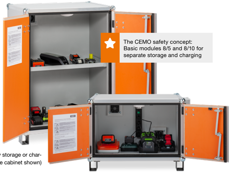
Model 8/10 Battery storage or charging cabinet (storage cabinet shown)